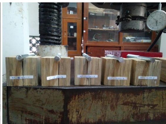
Gambar L-3.6. Hasil Uji KT – 12 mm