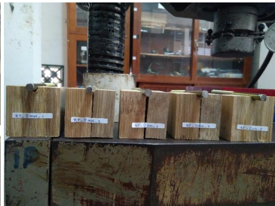
Gambar L-3.4. Hasil Uji KT – 8 mm