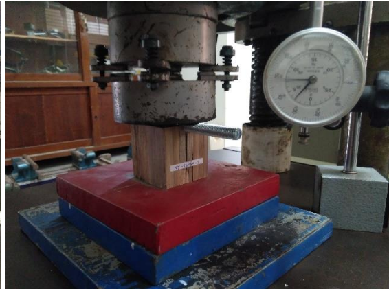
Gambar L-3.2. Uji KT – 10 mm