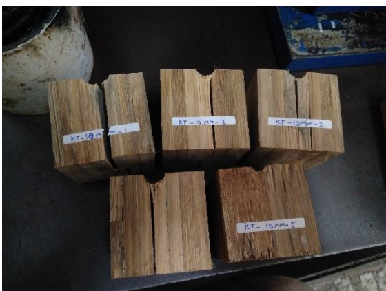
Gambar L-3.5. Hasil Uji KT – 10 mm