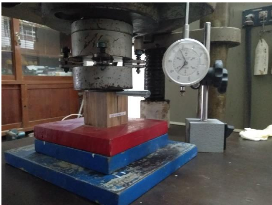
Gambar L-3.3. Uji KT – 12 mm