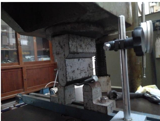
Gambar L-2.5. Uji KL-12mm-1