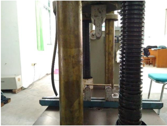
Gambar L-2.1. Tampak Samping