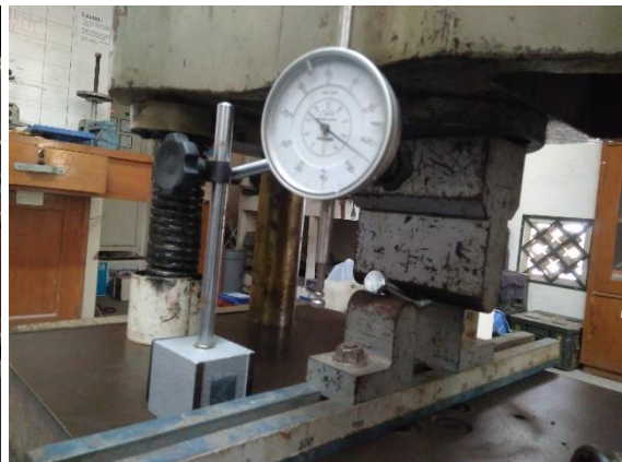
Gambar L-2.4. Uji KL-10mm-2