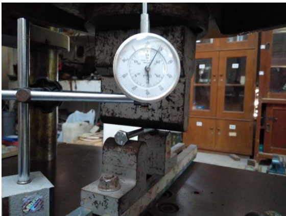
Gambar L-2.3. Uji KL-10mm-1