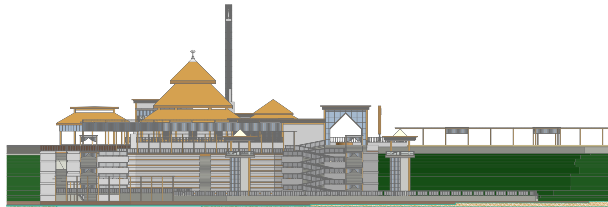
TAMPAK SELATAN KAWASAN