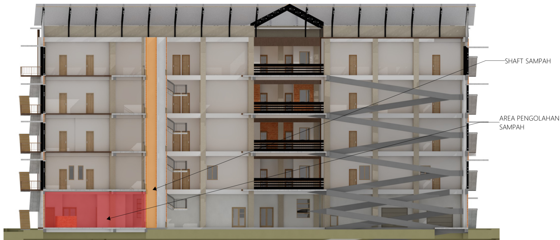
SKEMA PENGELOLAN SAMPAH