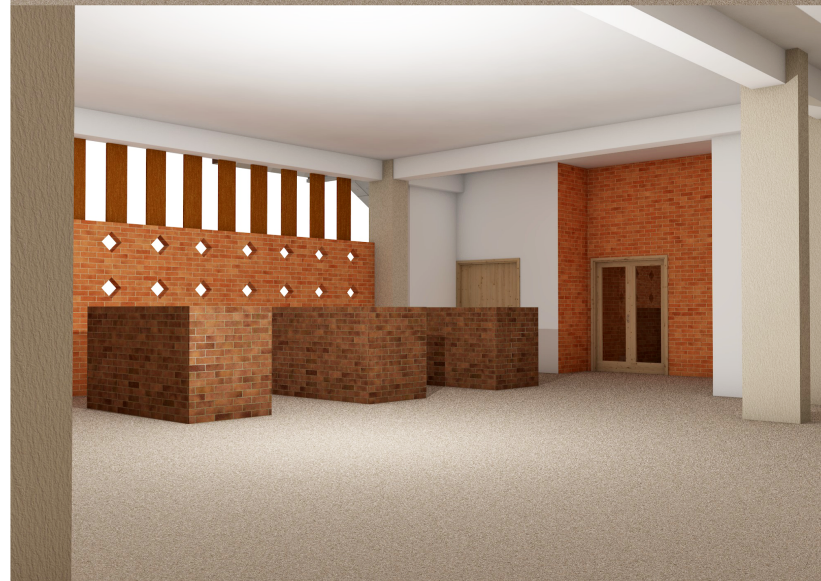
DETAIL GARBAGE MANAGEMENT AREA 1:100