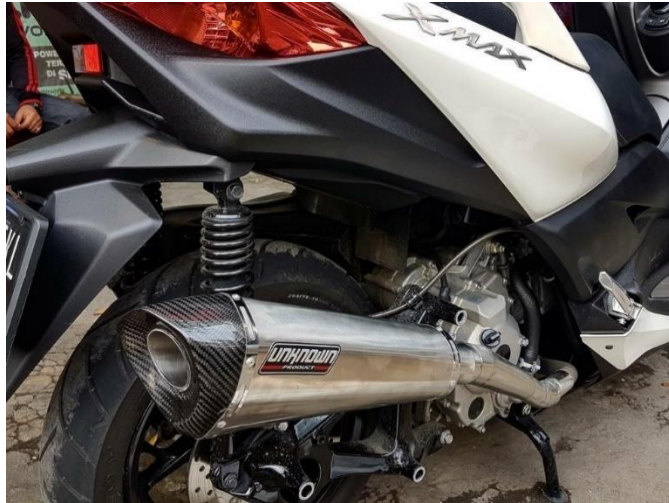
Figure 4.8. Delta Type Exhaust System