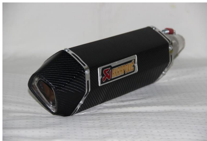
Figure 4.14. Fake branded Akrapovic Exhaust System in Indonesia.

motorcycle until automobile, they recreated Akrapovic exhaust system by counterfeiting the brand name and producing exhaust system with low quality material and low quality control. The picture of fake brand Akrapovic exhaust system produced by a home-industry in Purbalingga is as follow: