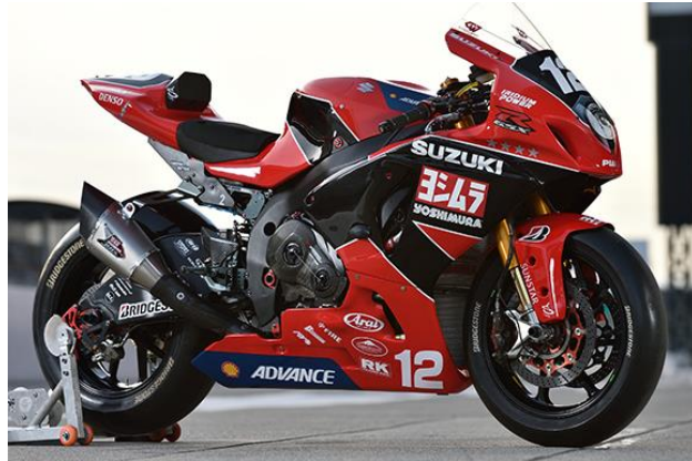
Figure 4.18. Exhaust System