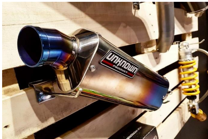
Figure 4.9. Sigma Titanium Type Exhaust System