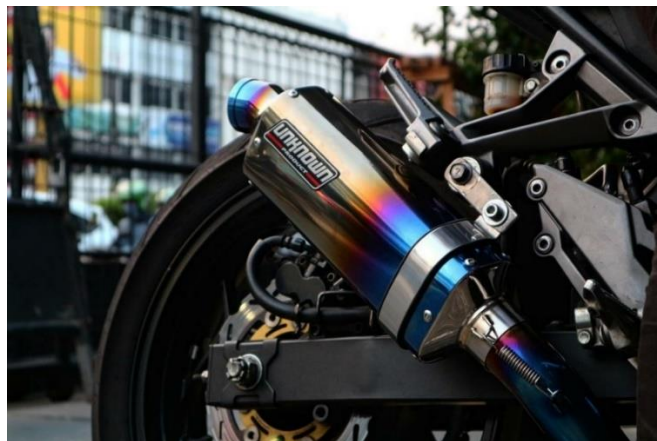
Figure 4.11. Sigma Titanium Type Exhaust System