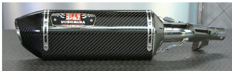
Figure 4.19. Road Legal Yoshimura R77 Series

This figure shows the Yoshimura and Suzuki relationship in World Superbike Championship. A Suzuki GSX-1000R fitted with Yoshimura exhaust system for race use only.