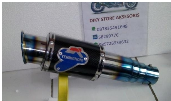
Figure 4.17. Fake brand of Termignoni exhaust system