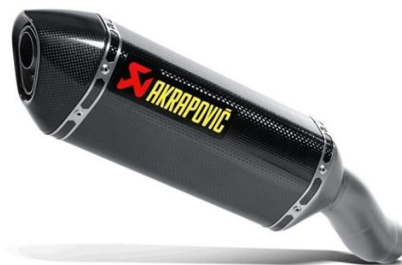
Figure 4.13. Akrapovic Slip-on Exhaust System