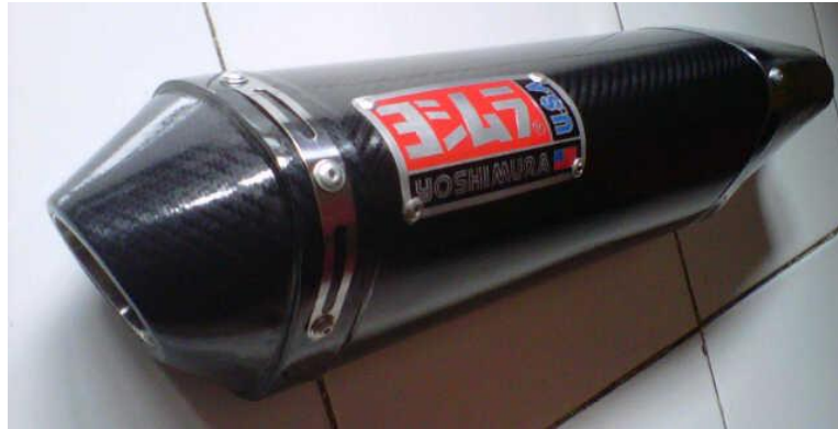
Figure 4.20. Counterfeit exhaust system brand