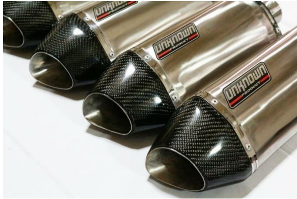
Figure 4.4. Reborn Type Exhaust System

Source: https://www.instagram.com/p/BWgxMEJhmNA/?taken-by=unk_product , in 2017