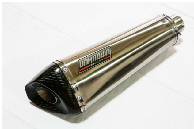
Figure 4.7. Delta Type Exhaust System