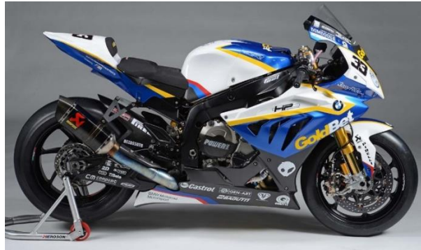
Figure 4.12. BMW S1000RR fitted with Akrapovic exhaust system.