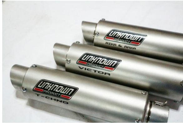
Figure 4.2. GP – Rebel Type.