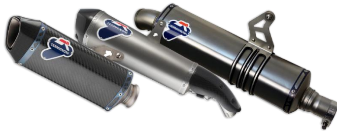
Figure 4.16. The selections of exhaust system by Termignoni