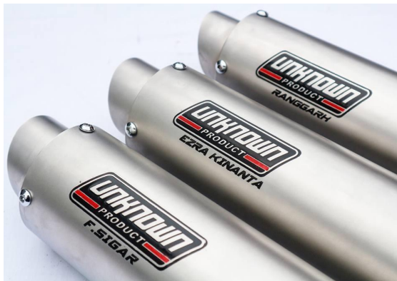
Figure 4.1. GP – Rebel Type.