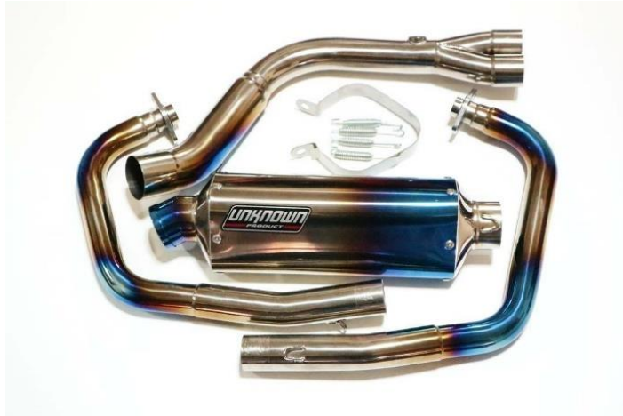
Figure 4.10. Sigma Titanium Type Exhaust System