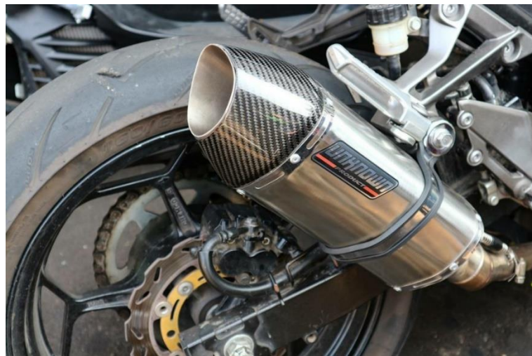
Figure 4.5. Reborn Type Exhaust System