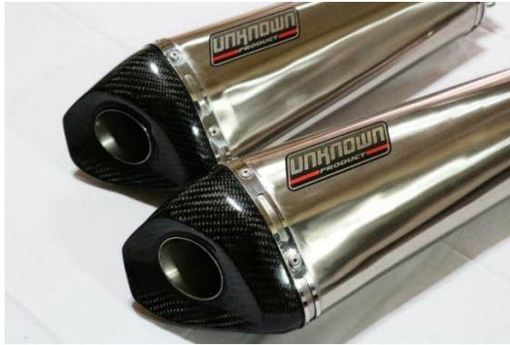
Figure 4.6. Delta Type Exhaust System