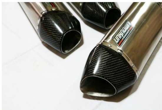
Figure 4.3. Reborn Type Exhaust System