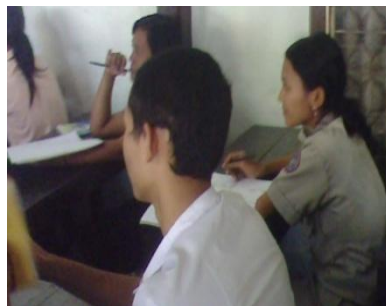
Picture 3. The student listened to the teacher's explanation