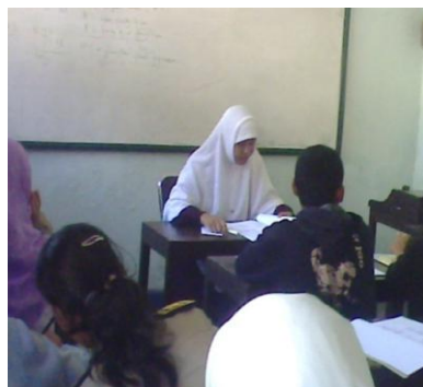
Picture.1 The teacher was preparing the material

In classroom scene of pre-teaching, the traditional classroom speaking class at ECC made the student felt not comfortable in class because the design is too narrow. And also, the position of the teacher sitting in the middle of the class blocked the white board.