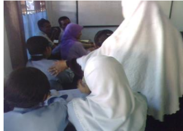
Picture 5. The teacher moved naturally

The teacher moved around in class activities because she wanted to control activities in class. The writer noticed that The teacher wanted to must be familiar with the situation in class, whether the students have been ready or not for learning, the text book, the situation in class, whether it is noisy or quiet. Meanwhile the teacher also worked hard to familiarize the situation in class, so the teacher explanations can be absorbed by the student effectively.