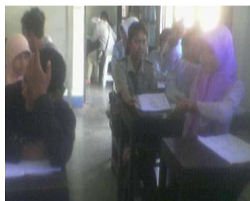
Picture 4. The students were having discussion with the partner

During this communicative activity the students were asked to introduce their backgrounds. Then they talked with the partner in front of the class, so the students were expected to be able to improvise dialogs in this activity.