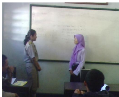
Picture 6. The Role Playing in front of the class

Role play created active participation to help the students learn language effectively. It was apparent that the students wanted to be able to speak English correctly. If they made mistakes in communication, they would certainly feel nervous. However, by using role play activities, it could be seen that the students were motivated to speak bravely. Besides memorizing the dialog, they also had the opportunity to improvise some other dialogs which are not written in the textbook. This made their performance more natural.