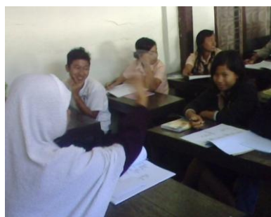
Picture 2. The teacher began the lesson

In this stage, the teacher explained the material from textbook. The first step, the teacher gave an instruction to begin the lesson and opened the textbook in the classroom. In the second step, the student listened to the teacher's explanation based on the textbook. The teacher could create fun activities to make students interested and give meaningful vocabulary or difficult word from the textbook. The teacher spent 15