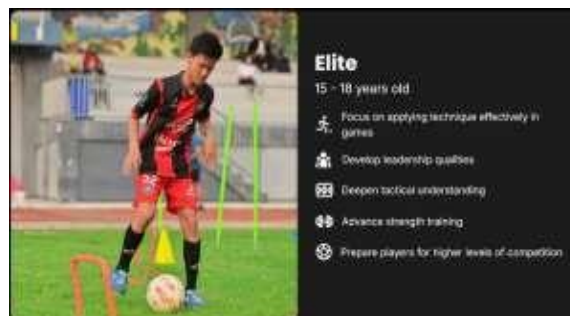
Image 2.1. Player Development