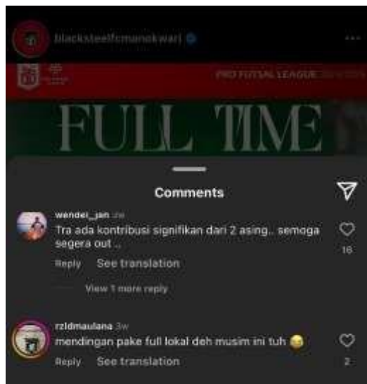
Image 3.1.Hate Comment

"Many players consider social media as a tool to raise their brand (players), from social media they can also get more income beyond their income as football athletes. Even though it can be a second income, of course, there are negative impacts such as overthinking that causes their mentality down due to negative comments from netizens. You can say that the player's mentality can be down because of the hate comment of 60%." (interview February 3, 2025)