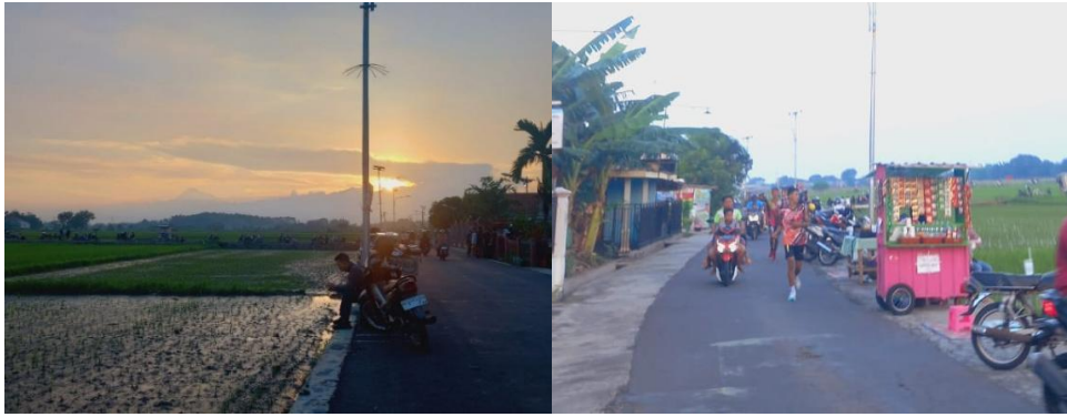
Figure 6 Pic left(A person is enjoying the view), pic right (Some people are jogging)