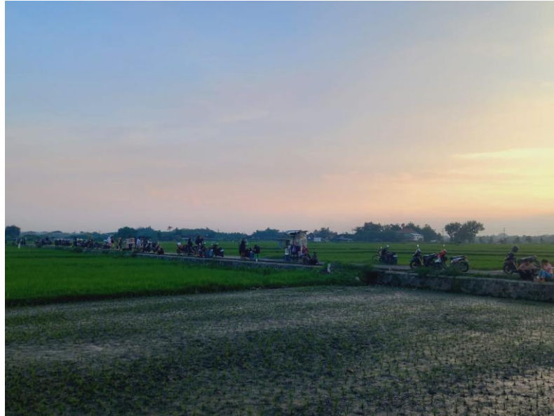
Figure 3 View of open area of Sawah Cengklik

In vast open area of Sawah Cengklik, most of the people visiting this place spent their time by enjoying scenery to the west. In this direction, people observe some elements. . First, is the ricefield as the foreground. With no vertical object interrupt the vastness of the agricultural field, this space can be understood as foreground. Above this field is the sky spread in the entire space acting as background for the scenery. In between these two elements of the panorama, a horizon is stretched separating as well as connecting the earth and the heaven.