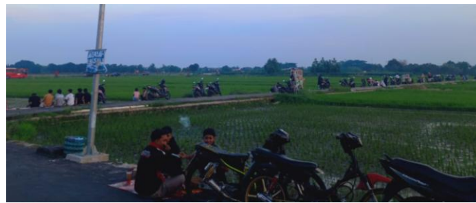
Figure 7 People are socializing

For Gehl (2011) social activities can be understood as the resultant of the necessary and optional activities. While some youths enjoying meals, for instance, they gather with their peers and interact with the street vendors. Families spending good times on late afternoon with some other people they are acquainted with.