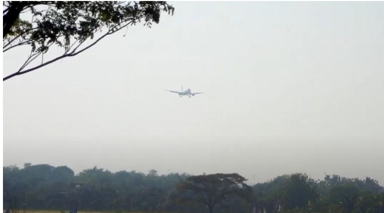
Figure 4 View of plane landing