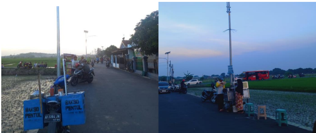
Figure 5 Street vendors

The main activity in the Adi Sumarmo rice field area is culinary or street vendors who sell in the area, almost every day there are always street vendors who sell from 3 to 6 pm. These street vendors come to sell snacks, simple meals, refreshments and drinks. They are peddlers finding livelihood in place where people most likely come and buy.