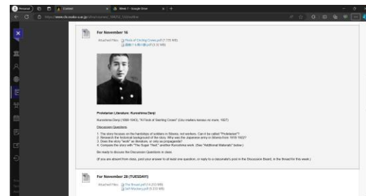
Figure 1. Many classes at Osaka University often employs group discussions

I attribute my change of attitude significantly to the classes in which I enrolled. Most of the courses I attended incorporated many group discussions. This forced me to engage with the classroom, resulting in a deeper acquaintance with them. The group discussion sessions served as a great platform for interaction, since I would not have taken the initiative to engage with my classmates otherwise.