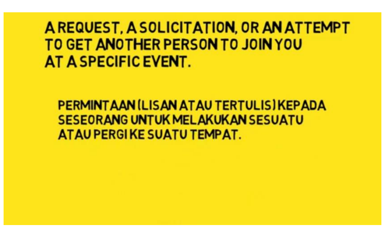
Explaining information on writing invitation letter (screenshot)

Closing activity: I tried to do evaluation about the lesson to see how they understand the lesson.