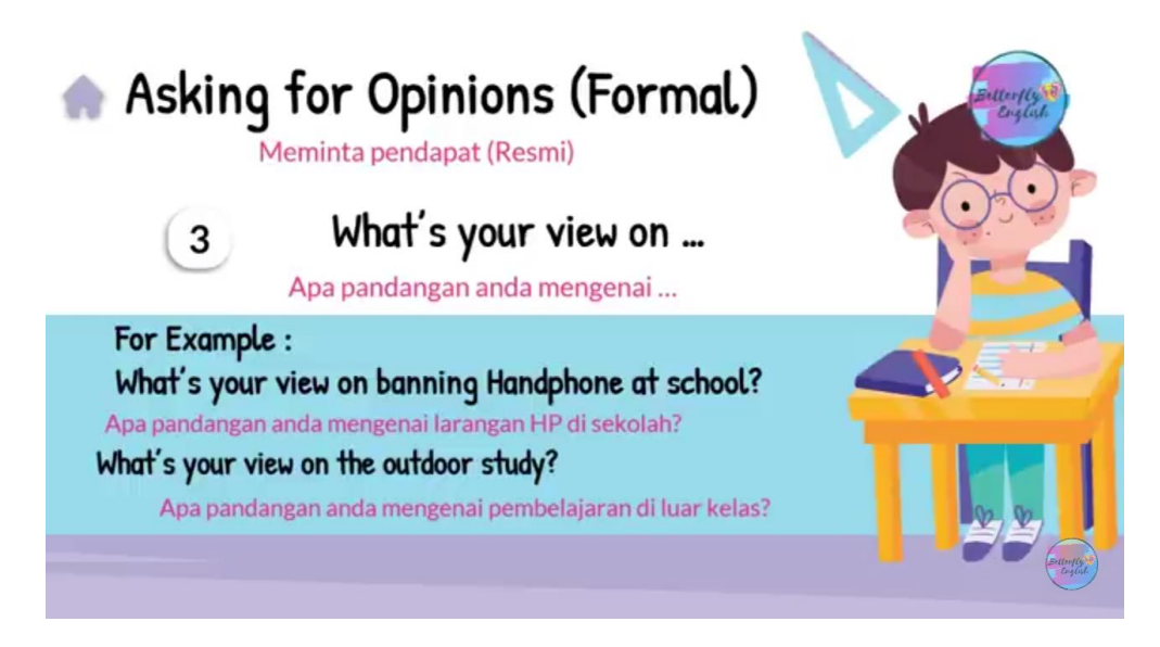
Example of asking for opinion formally (screenshot)