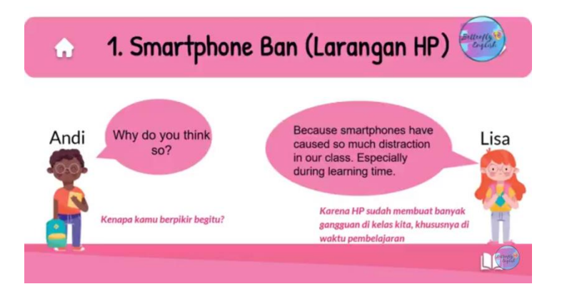
Example of conversation about asking and giving opinion (screenshot)

The topic today was about procedure text. The students get acquainted with me first and then show them the PowerPoint and explained to them what is meant by procedure text. I also explained to the students characteristic, purpose, and structure of procedure text. I showed an example of an image of procedure text. I. last but not least, I gave them a video lesson about procedure text, they pay attention well to the video, they payed attention and listened to the video explanation and music background, I also to do evaluation about the lesson to see how they understand the lesson.