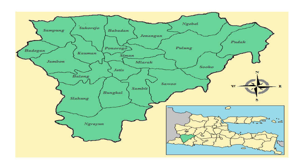
Picture 4.1: Map of the Legal Territory of the Ponorogo Religious Court

Ponorogo Regency is an area in the province of East Java, which is about 200 km southwest of the provincial capital, and about 800 km east of the capital city of Indonesia. Ponorogo Regency is located at 111° 7′ to 111° 52′ East Longitude and 7° 49′ to 8° 20′ South Latitude.