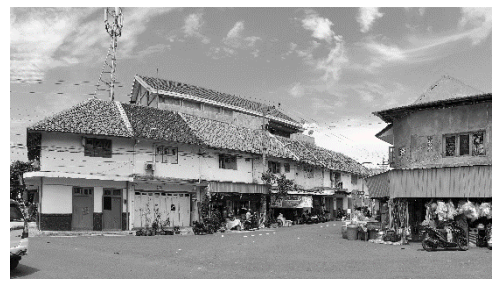
Picture 2 Chinese Settlement in Jalan Belimbing.

In the social history of Java Island, Pekalongan was one of the ports on the north coast of Java which became a stopover for ships from the Arabian and Chinese peninsula during Dutch rule due to a very strategic coastal environment. According to Van Leur (1983) and Van Den Berg (1989), during the VOC era, Pekalongan was used as a fishing center and also developed into a center of settlement and trade. In the 1960s, Jalan Kerimunan (now: Jalan Belimbing ) was a residential area, not a mix-used area as it is today. Even though the current condition is mixed with business buildings and shops, some ancient buildings still look attractive because they are still being preserved so that they can become an attractive area for tourists to visit to see firsthand the conditions of the Pekalongan Chinatown in the past and to enjoy the architectural style of Chinese buildings living in Pekalongan.