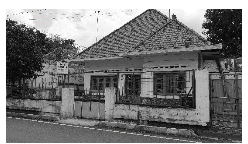
Picture 3 Arab Settlement in Sugihwaras Sub-district.

According to statistical records in 1885, in Java there were six large Arab colonies, namely Batavia, Tegal, Pekalongan, Semarang, Surabaya and Madura (Van den Berg, 1988). Administratively, Kampung Arab in Pekalongan City is located in three sub-districts, namely Sugihwaras, Klego and Poncol. However, Kelurahan Sugihwaras is one of the kelurahan with a higher dominance of Arab ethnicity than other kelurahan (sub-district). From the time of Arab colonies initial arrival until now, these ethnic descendants live and form their own residential neighborhoods. Kampung Arab as a manifestation of a residential environment is very thick with Islamic nuances where the socio-cultural activities of the community are full of Islamic cultural values.