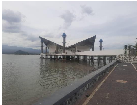
Figure 9. Landmark

Beside the natural surroundings, the location of the park is strategically located near many other public facilities including supermarkets, gas stations (pertamina), hotel, and a famous beach within the town.