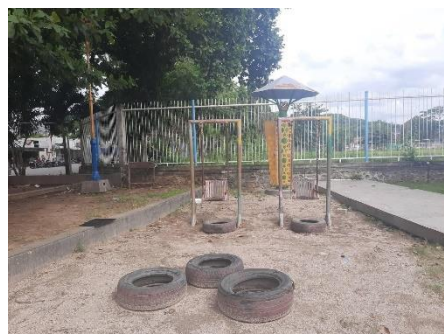
Figure 16. Play Area