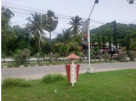
Figure 7. Surrounding View

The park is located in the tourist area and has the purpose of being able to provide aesthetic value that is synergized with the beach tourist destination which is Lawata Beach. The park is located near the seashore as it emphasizes the natural view around for the key point to provide experiences. Furthermore, the park is located right next to one of the iconic Landmark in Bima; Amahami Floating Mosque.