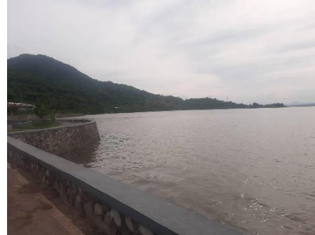
Figure 8. Surrounding View