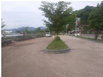
Figure 1. Parking

Service is one of the aspects that is mostly considered in the development of an urban park. Based on the result of the on-site observation conducted, the service of Amahami Park consists of the presence of the parking area and vendor service area.