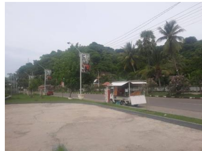
Figure 2. Street Vendor

The provision of sufficient parking area is a good point from the park. However, even though there is a large parking area reserved for visitors located in the north side of the park, the space along the street in front of the park is also utilized for parking. This issue presents a visually unpleasant view of the vehicle ocean at the first sight of the visitors. Not only the vehicle but also street vendors that disturb the view of the park. In