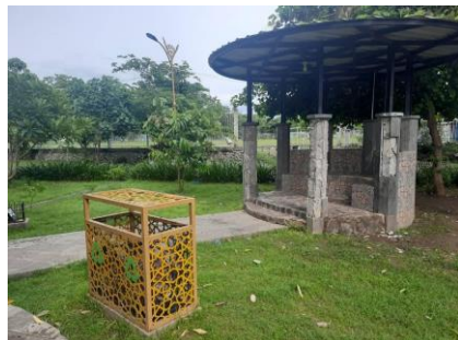
Figure 14. Trash Can