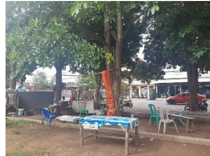
Figure 11. Vendor