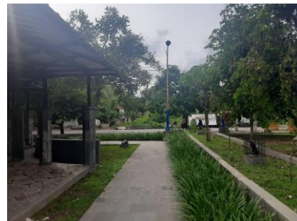
Figure 15. Vegetation