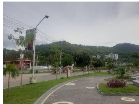
Figure 4. Street Lamp