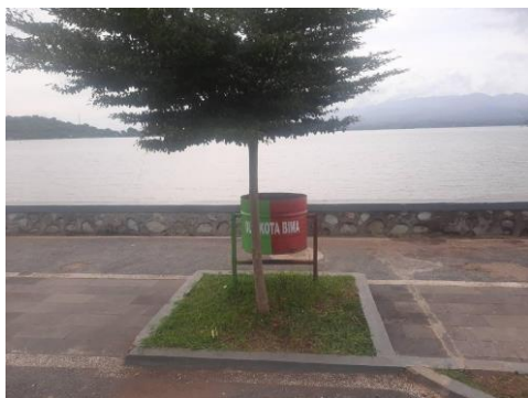
Figure 5. Trash Can