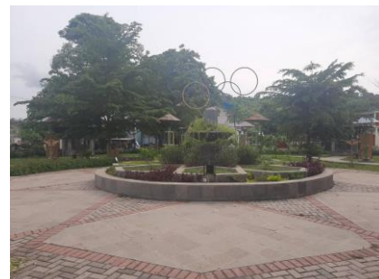
Figure 18. Landmark

To sum up, the comparison between Amahami Park and Manggemaci Park is simply described in the table below: