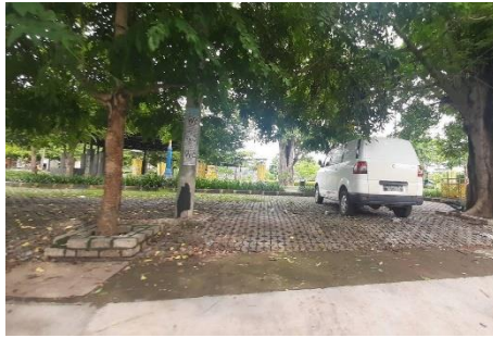
Figure 10. Parking