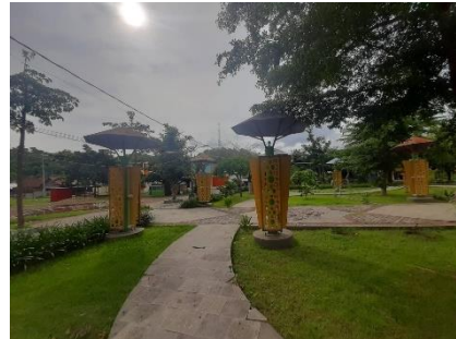
Figure 13. Lamp