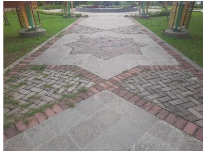
Figure 12. Path

Manggemaci Park, according to urban park category from Ismail (2014), can be categorized as an Active Park, where Manggemaci Park has the function of park that is combined with sports facilities, the layout is consist of the jogging tracks, and other supporting facilities that can accommodate particular types of sports. Furthermore, the park is located right next to the sports field, and sport centre.