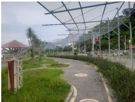
Figure 3. Pathway

The pedestrian light is only a few and sometimes is not lit, when it is nighttime, the source of light is sometime only come from the vendors, but the dimness create a certain ambience to the park that it is aimed for visitors to enjoy the view of light reflection to the sea surface that is far away. Furthermore, the street light is still operating properly, adding more sense of security to the visitors. The trash bins are located every 5-10 meters along the park as an effort to minimize visitors littering around.