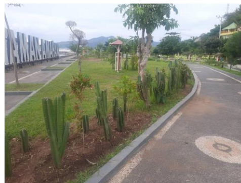
Figure 6. Vegetation

However, not all of those five mentioned elements can be classified as proper facilities, for instance there are only a few numbers of big vegetation that made the park look dry during the daytime. Not only that it just has a few parts of shady areas, the facilities like toilets are not directly provided. Visitors have to go to the mosque -next to the park, to go to the toilet.