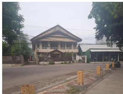
Figure 17. Surrounding View

As the park location is in the middle of the town, it can be said that Manggemaci park is strategically located since it is surrounded by several commercial facilities including a cafe, a Convention Hall, and minimarkets.