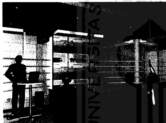
Gbr. 5.26. Perspektif interior (ruang presentasi digital)