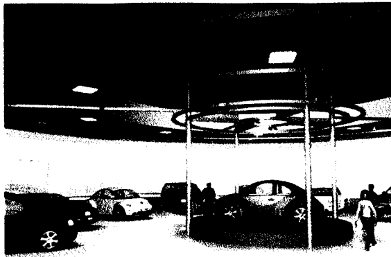
Gbr. 5.24. Perspektif interior (ruang showroom)