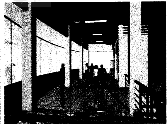
Gbr. 5.29. Perspektif interior (ruang komunitas lantai 2)