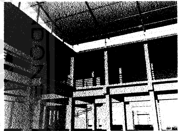
Gbr. 5.27. Perspektif interior (ruang hall/atrium)