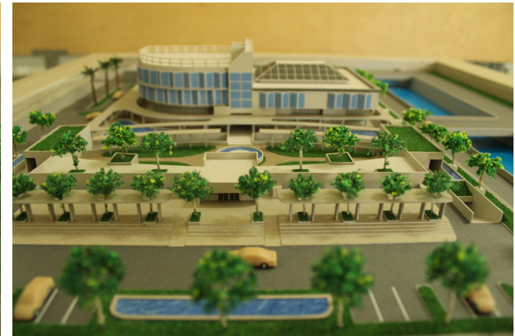
Water Gallery Center Skala 1:250