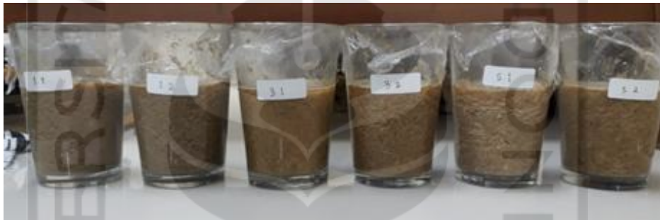
Gambar 3. Sampel SSF