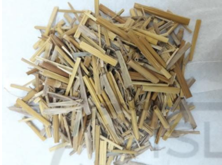
Gambar 1. Jerami padi kering