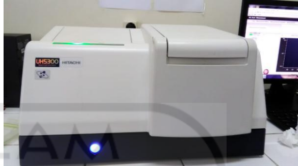
Gambar 2. Spektrofotometer UV-Vis