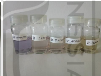
Tanpa penambahan H 2 O 2