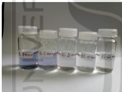
Penambahan H 2 O 2