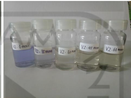
Tanpa penambahan H 2 O 2