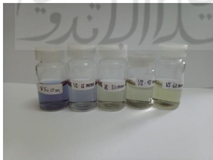
Penambahan H 2 O 2