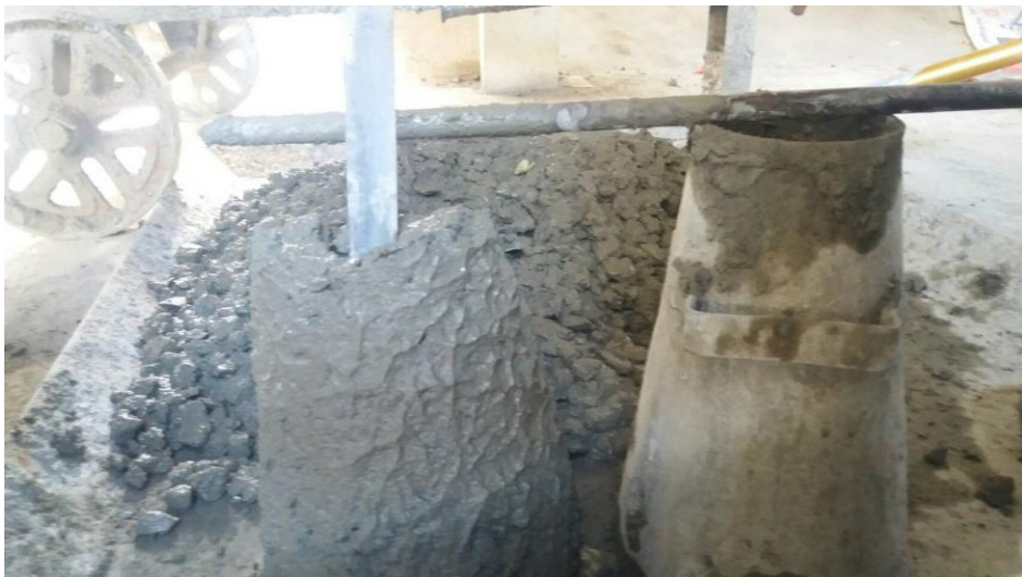
Gambar L-4.2 Slump BSR 0,5