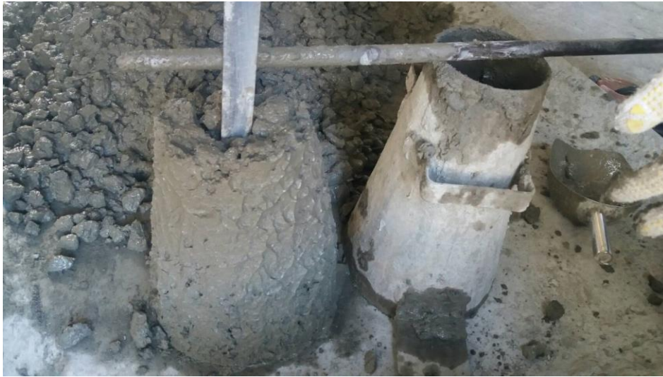
Gambar L-4.3 Slump BSR 1