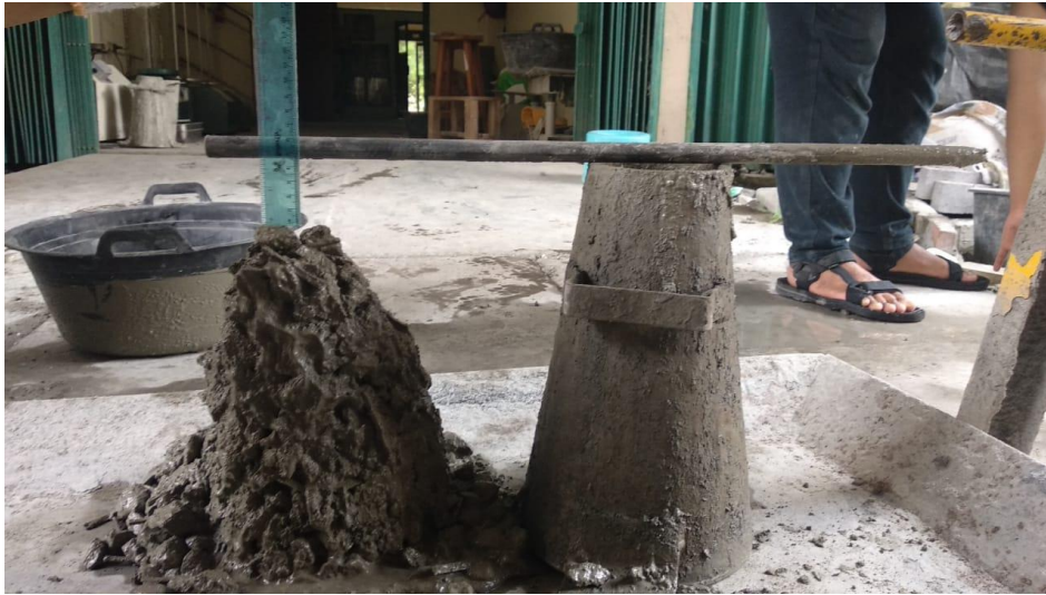
Gambar L-4.5 Slump BSR 2