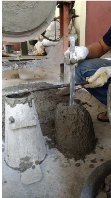
Gambar L-4.1 Slump BN