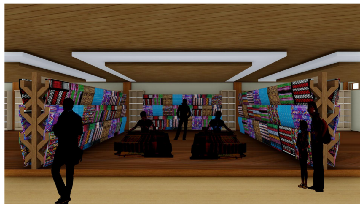
AREA DISPLAY & WORKSHOP TENUN