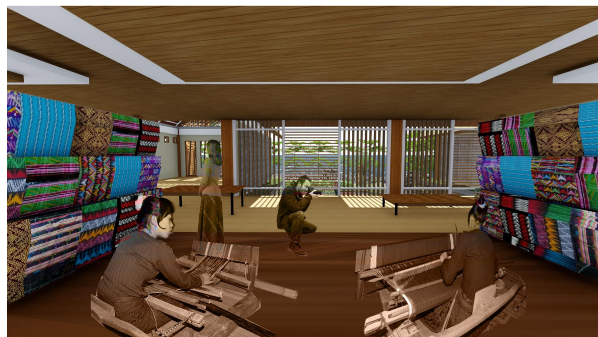
AREA WORKSHOP TENUN