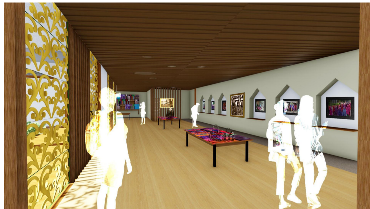
AREA DISPLAY A & STORAGE TENUN