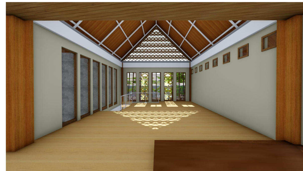
INTERIOR ORNAMEN FASAD & SUN SHADING