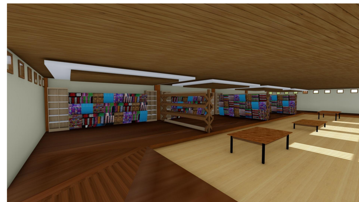
INTERIOR AREA DISPLAY & WORKSHOP