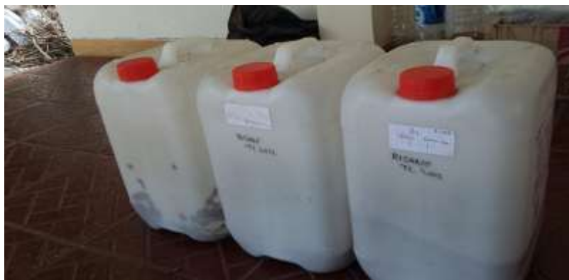
Picture 2.1 Reactors from Jerry Can

This study is an organic fertilizer production using anaerobic reactor (10 liter jerry can) as much as 3 reactor. Solid waste taken from vannamei shrimp farms in the village of Poncosari Bantul, Yogyakarta.