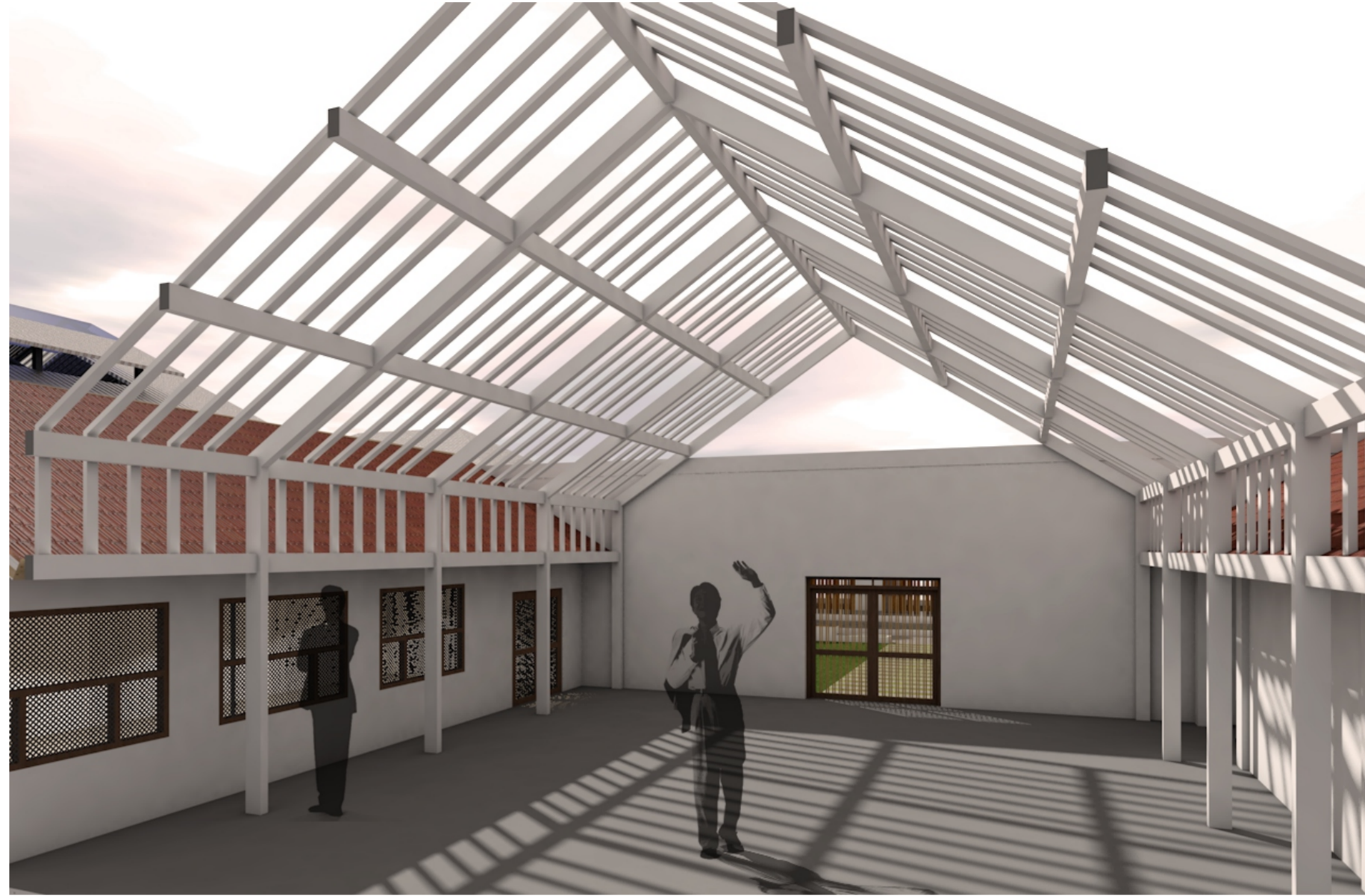
OPEN AREA, BETWEEN OLD BATIK INDUSTRY AND GALLERY