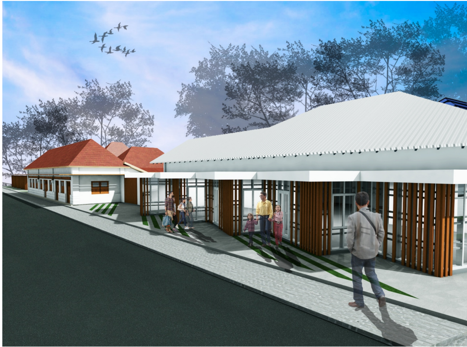
FRONT AREA, OLD AND NEW BUILDING