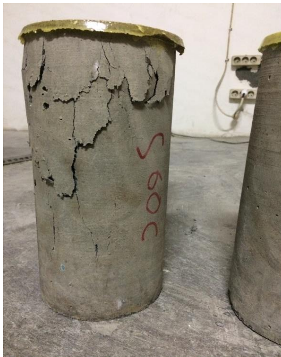
Gambar L3.1 Silinder beton setelah uji tekan