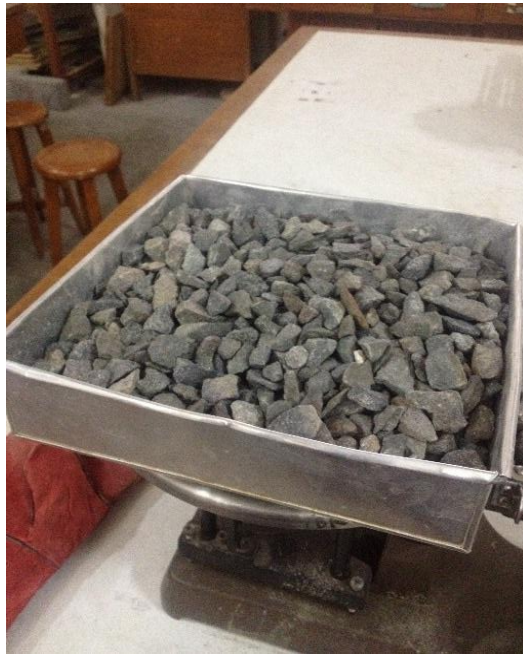
Gambar L2.2 Agregat kasar alam Kali Progo