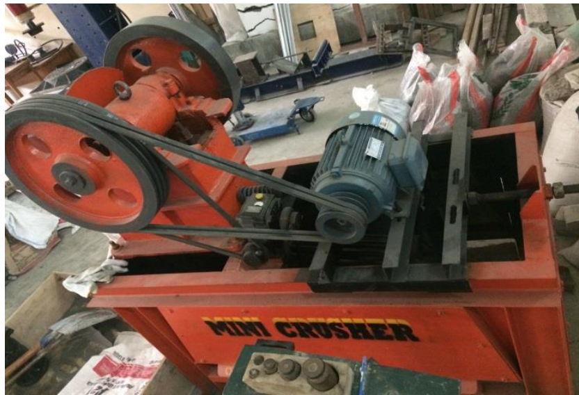
Gambar L1.10 Mini stone crusher