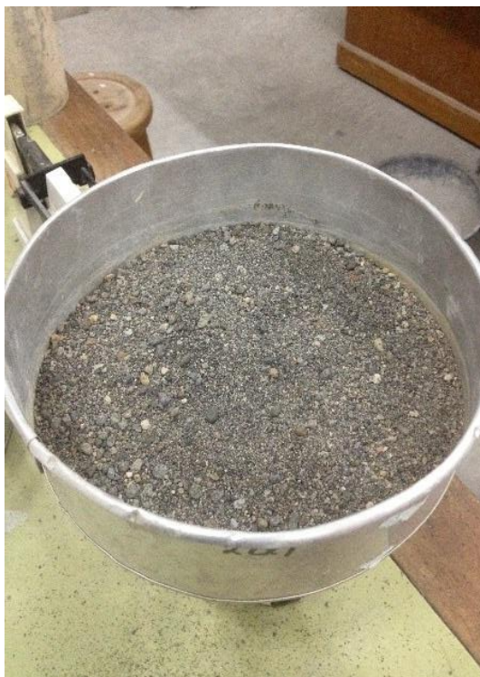
Gambar L2.3 Agregat halus, pasir Progo