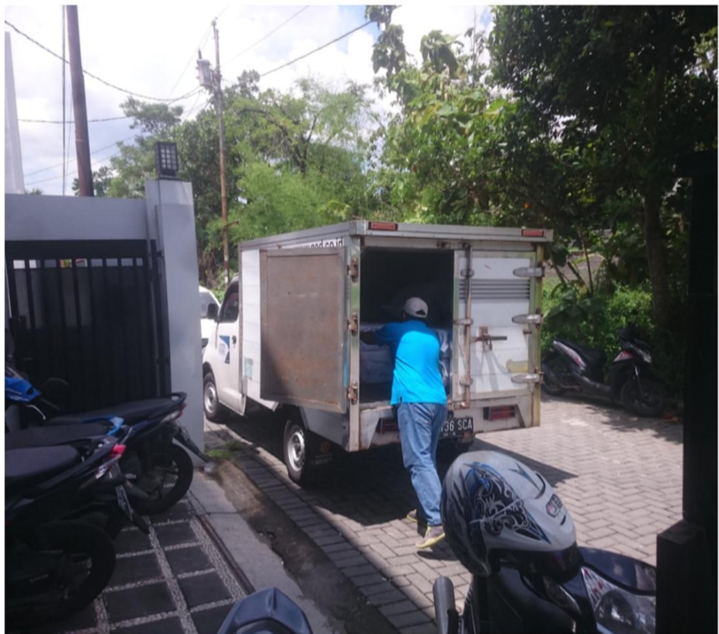
Lampiran 1: Proses penerimaan barang