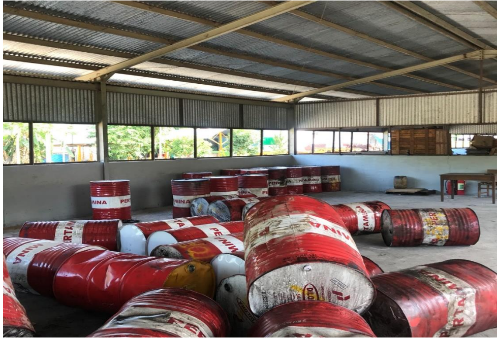
Gambar 7: Observasi kondisi eksisting TPS Limbah B3