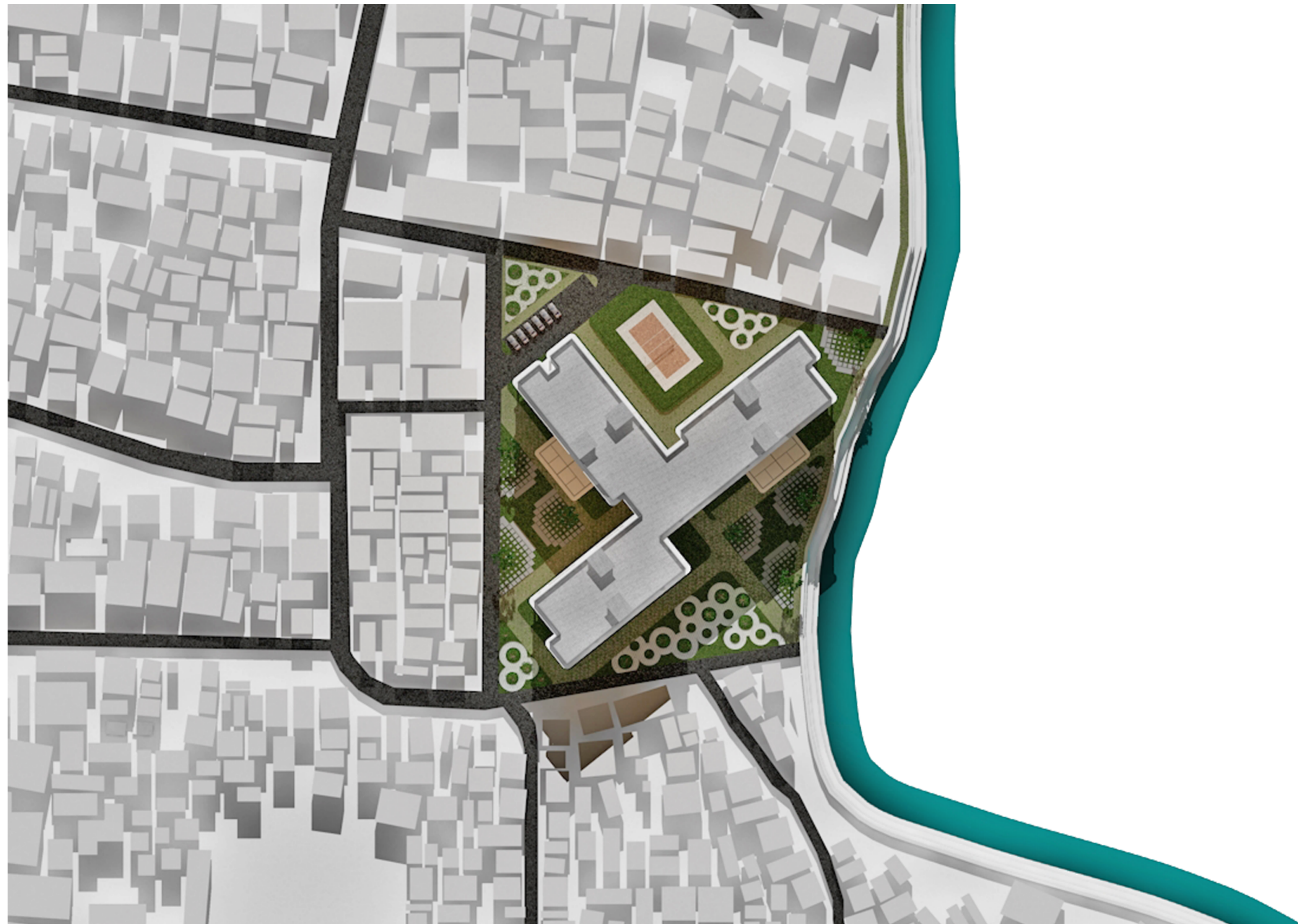
SITUATION SKALA 1 : 500