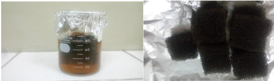
Gambar 2 Coating Ag-GO