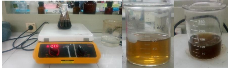
Gambar 1 Proses sintesis Ag-GO