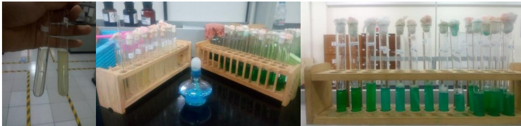
Gambar 5 Pengujian antibakteri total coliform