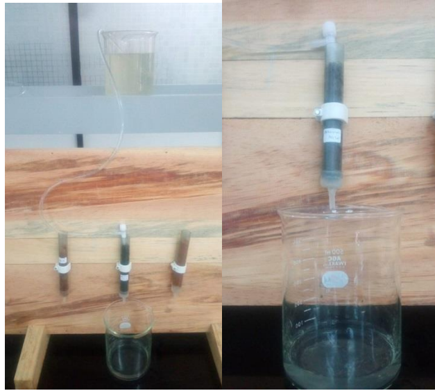
Gambar 4 Pengujian media filter skala pilot